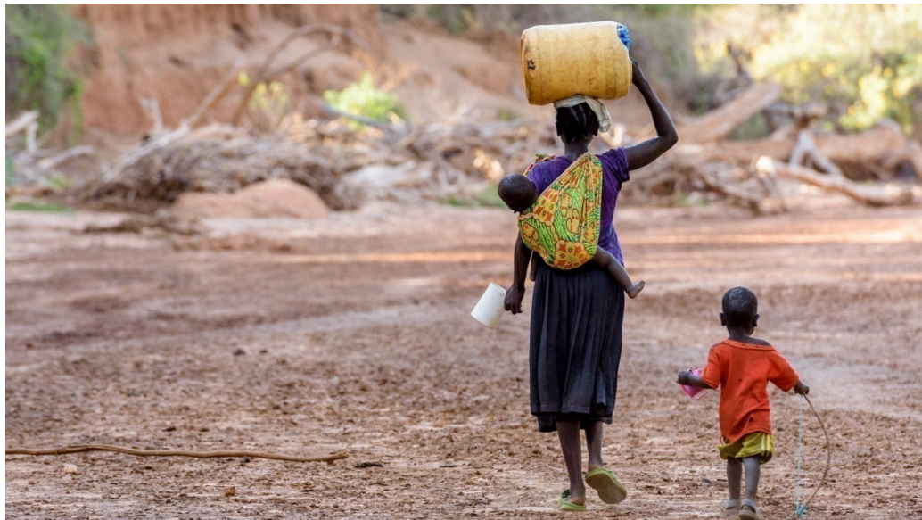
TRYING TO FIND WATER IN NORTHERN KENYA

Praise and thanks to God for His goodness.